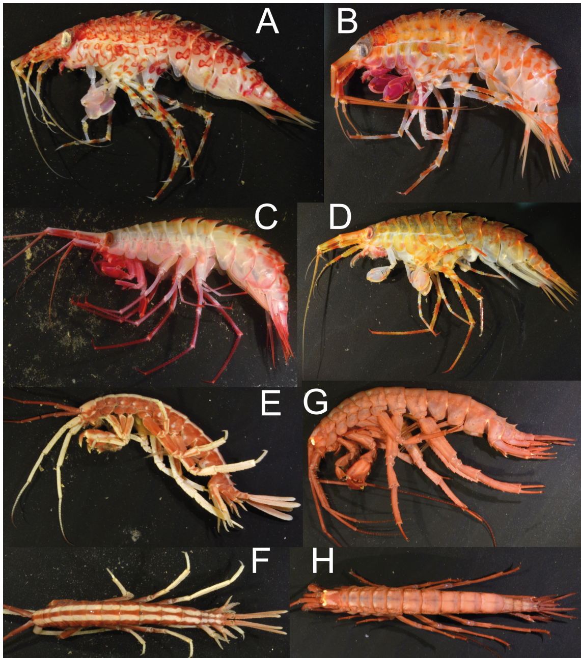
Fig. 3.8.3: A, Eusirus cplx perdentatus marbled (188-4); B, Eusirus cplx perdentatus spotted (196-8); Eusirus cplx giganteus non spotted (gray back / crimson legs) (204-2); Eusirus cplx giganteus spotted (P3-P4 striped) (217-6); E-F, Paraceradocus cplx gibber brown and white (224-3); G-H Paraceradocus cplx gibber all brown (220-2)