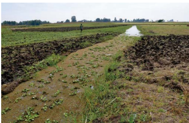
Fig. 5. Obstruction of irrigation canals