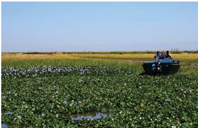
Fig. 4. Inaccessibility of the lake