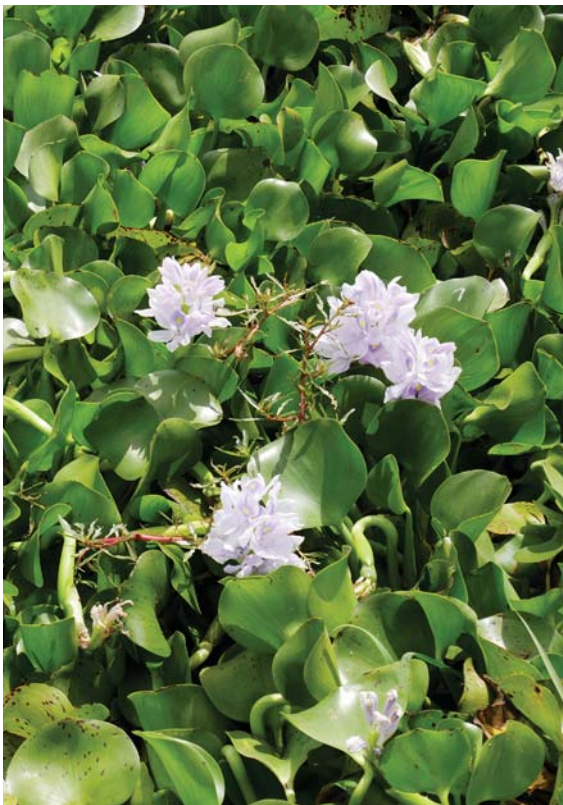
Fig. 2. Water hyacinth

The Eichhornia crassipes – or water hyacinth – is mostly known for its vibrant purple and violet flowers. The aquatic plant is also characterized by an extremely high reproduction rate and a tendency to form dense free-floating mats on the water surface. It originates from the Amazon basin in South America, but was introduced all over the world as a pond ornamental. In the absence of natural enemies and with favorable environmental conditions (temperature, water nutrient level, water acidity and etc.) water hyacinth populations can thrive and populations can double in area in just 5 days (Malik, 2007). Destructive water hyacinth infestations occur in Asia, USA, Australia and particularly in Africa. Inferring with local biodiversity, the weed affects the production of ecosystem services. Also, it has been recognized as the world's worst water weed and has garnered increasing international attention as an invasive species. According to climate change models, its distribution may expand into higher latitudes as temperatures rise, posing problems to formerly hyacinth free areas (Rahel and Olden, 2008). Thus, it leads to social, environmental and economic disturbances.