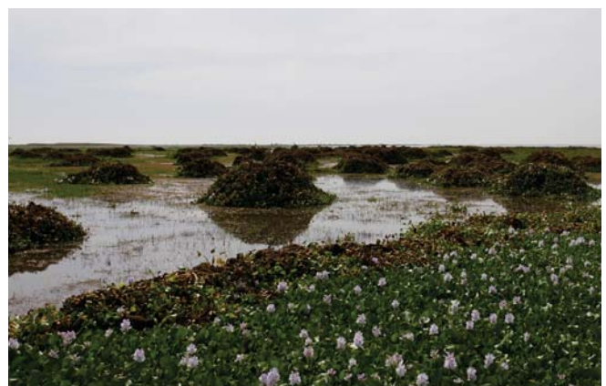
Fig. 6. Invading wetlands/farming areas

The infestation of water hyacinth on Lake Tana is a 'public good', characterized by non-rivalry and non-excludability. The control or eradication of the infestation is thus a public good as well. To determine what the economic value of a water hyacinth free Lake Tana is, the impact of the infestation on all the stakeholders needs to be assessed. In a contingent valuation study, respondents state their willingness to pay for a hypothetically created market.