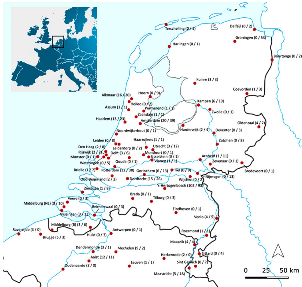
Fig. 1 Study area (the Netherlands and northern Belgium) and locations of sites used in this review, with the number of analysed pollen samples (P) and number of samples analysed for botanical macroremains (M) (P/M)

Publisher's Note Springer Nature remains neutral with regard to jurisdictional claims in published maps and institutional affiliations.