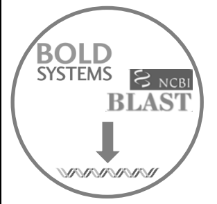
Download all sequence data available for the genus