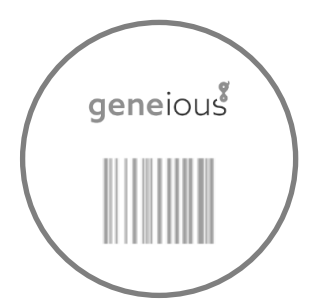
Filtering the data and selecting 'promising' markers