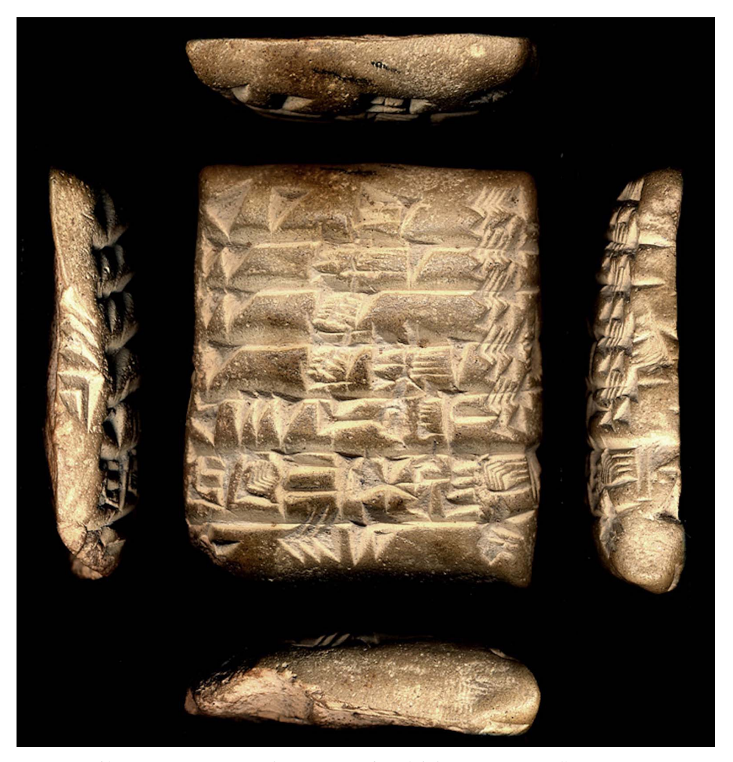
Figure 4. Tablet in Sumerian (Ur III) that mentions a fat-tailed sheep. Anonymous collection (CDLI P313095).

(Figure 1(b)). Iconographic depictions from this period often show a well-developed woolly coat (Figure 3) (Vila & Helmer 2014). Mesopotamian texts mention a diversity of sheep types of various origins as early as the third millennium BC (Figure 4), and later textual descriptions of wool quality and colour in the Near East and Aegean regions also confirm this diversity (Breniquet & Michel 2014). One hypothesis, therefore, is that woolly sheep breeds were favoured by urban development and the associated increasing demand for textile production.