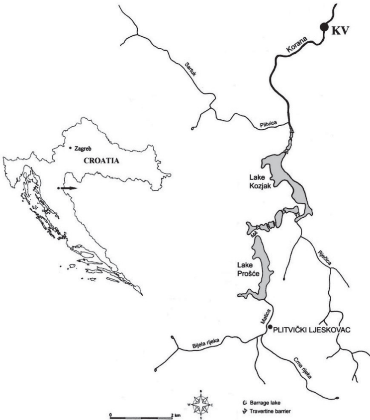
Fig. 1. Map of the study site: Korana River in Korana village (KV).

The single male was collected in an emergence trap set-up at Korana River in the village of Korana (Fig. 2). Six pyramid-type emergence traps were operated from February 2007 to February 2009. Traps were sited in such a way as to ensure representative sampling of emergence from all microhabitats present at each site. Each trap was a 50 cm tall, four sided pyramid with a base of 45×45 cm, fastened to the streambed to allow the free movement of larvae in and out of the sampling area. The side frames of the traps were covered with 1-mm mesh netting (Ivković et al. , 2013). The site completely dried out in the summer months of 2007 (July – mid September), but not in 2008.