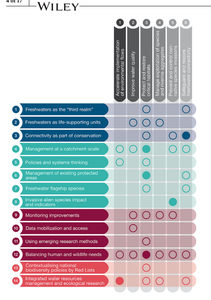
FIGURE 2 Matrix diagram illustrating where the 14 Special Recommendations expand upon or complement Tickner et al. (2020)'s priority actions. Filled circles indicate parallel coverage, and open circles indicate where SRs provide means of implementation for priority actions, as these topics were not specifically covered by the priority actions

(HD; 92/43/EC; Figure 3) Directives are the EU's two main policies for nature conservation. Areas protected under these two Directives form an ecological network, Natura 2000, which covers 18% of the EU's land area and river network (and \sim 8\% of its marine territory; its coverage of nonriparian freshwater habitats has not been quantified). Its main purpose is to maintain—or restore—Europe's most valuable and threatened habitats and species to a favorable conservation status. The European Red List of Threatened Species (European Commission, 2010) provides assessments and listings of conservation status for European species.