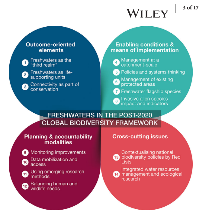
FIGURE 1 Summary of the 14 Special Recommendations organized around the four clusters of the GBF planning process

The Ramsar Convention on wetlands (1971), the first coordinated global-scale political effort in freshwater biodiversity conservation, focused on sustainable management or "wise use" of wetland habitats (including coral reefs and estuaries). Its list of wetlands of international importance covers 13–18% of the global wetland area (Davidson & Fin-