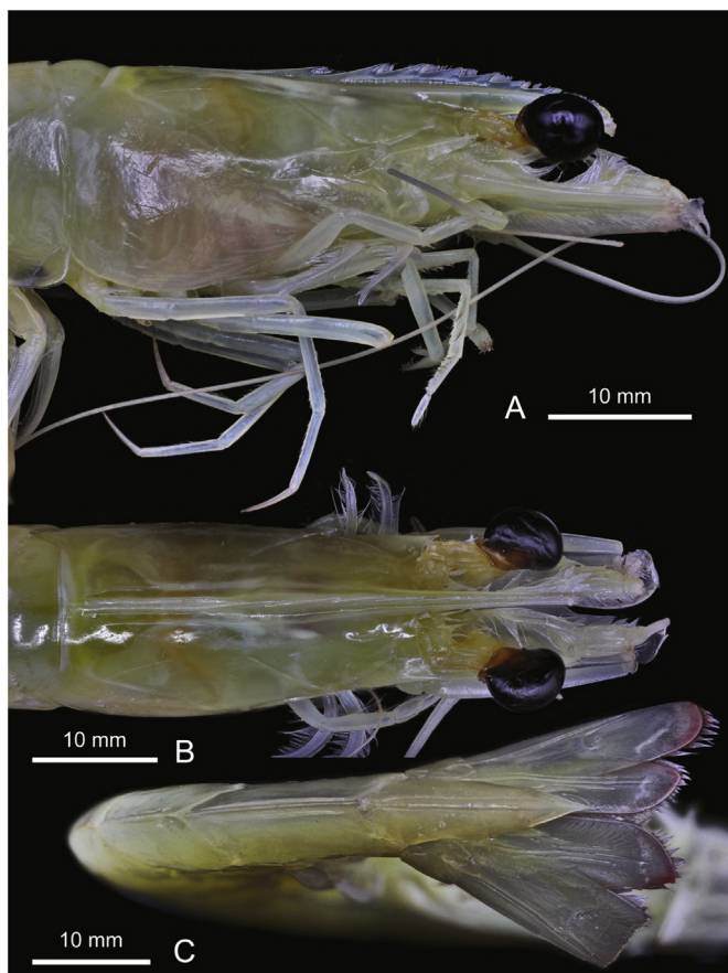
Fig. 2. A. Lateral anterior view of the Belgian Penaeus aztecus . B. Anterior dorsal view. C. Posterior dorsal view.

approximately 110 m deep, is rarely found at depths exceeding 165 m, and reaches its highest densities between 27 and 55 m, mainly on muddy, sandy-mud or loose peat bottoms (Pérez Farfante, 1969; Cook and Lindner, 1970; Williams, 1984). The species spawns offshore and the planktonic larvae and postlarvae are carried into estuaries by currents. They utilize estuarine marshes as nursery grounds. The juvenile shrimps grow within estuaries until they reach > 70 mm total length and then migrate offshore to mature and spawn (Knudsen et al., 1989; Matthews et al., 1991; Arreguin-Sanchez and Castro-Melendez, 2000). Larvae and juveniles are known to withstand a wide range of salinities and temperatures (Re et al., 2005).