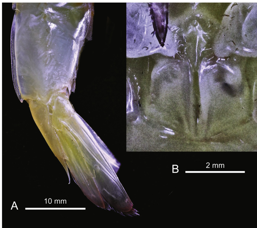
Fig. 3. A. Lateral view of pleonite 6 and tail fan. B. Developing thelycum.

The northern brown shrimp is a commercially important Atlantic shrimp (Tavares, 2002). Globally 40.000 t was landed in 2010 (NOAA 2013). It has been introduced in New Caledonia and French Polynesia for aquacultural purposes (Scannella et al., 2017). Recently it was discovered in the Mediterranean Sea, where it has spread remarkably fast. From the Gulf of Antalya, where it first appeared, it has spread