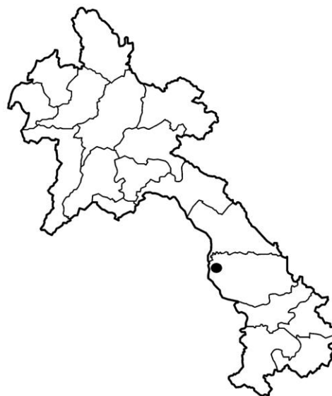
Figure 1. Megapomponia bourgoini sp.nov., distribution map.

Head : slightly narrower than mesonotum; castaneous with the following marks: a median piceous mark enclosing ocelli except lateral border of lateral ocelli, extending along posterior half of anterior arm of epicranial suture and anteriorly along midline, terminating posterior to frontoclypeal suture; fuscous area on anterior third of supra-antennal plate; fuscous mark on vertex about half the distance between eye and frontoclypeal suture, following curvature of eye to level of lateral ocellus where mark narrows, connecting to piceous mark that extends from posterior to eye. Head covered dorsally with fine golden pile, longer and thicker posterior to eye. Antennae piceous except castaneous scape, proximal pedicel, and ventral portion of first and second flagellar segments. Genae with large piceous spot. Lorum with piceous spot on posterior two-thirds. Postclypeus with piceous mark dorsally along midline splitting along medial borders of transverse ridges then fusing along midline centrally forming a castaneous spot on apical midline. Mark extending laterally into transverse grooves increasing in length reaching the border at the supra-antennal plate and the next three grooves, then decreasing in length in the next three